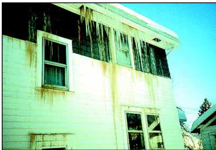
Heat loss into attics from air leaks, ducts or flues can lead to ice dams, even when the attic is vented.

However, ventilation is a minor factor in the determination of shingle temperature. Rose 24 showed that in Illinois ventila-